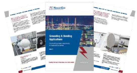
Figure 3 – Grounding & Bonding Applications Handbook

Although the range of processes at risk of charge generation are too numerous to discuss this Grounding & Bonding Handbook provides a general overview of some of the processes referred to in NFPA 77 and IEC 60079-32-1 and further information on static electricity as a potential ignition source.